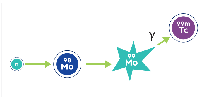
Figure 2. Schematic representation of Mo-99 production from neutron capture. 6